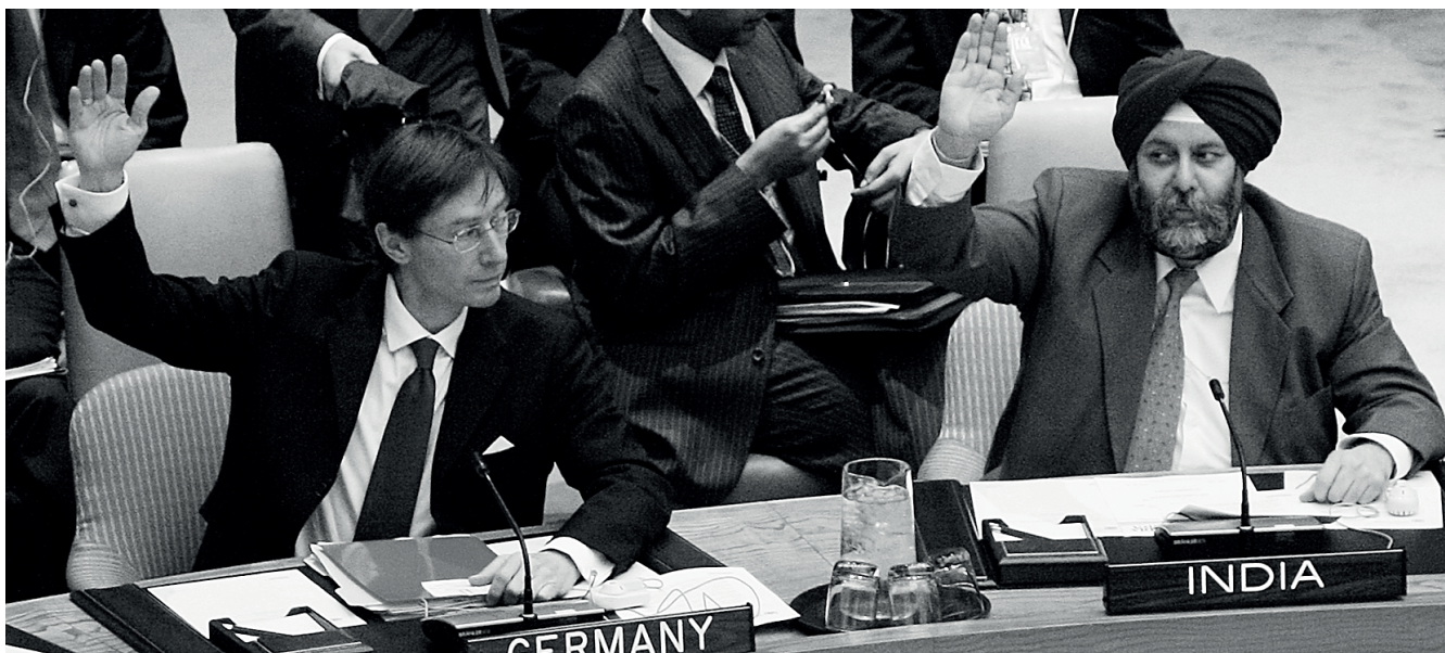
The German and Indian representatives during a vote in the UN Security Council. Germany abstained on resolution 1973 on the establishment of a no-fly-zone in Libya together with Brazil, Russia, India and China.

media since the 1970s. This suggests that German public opinion alone is unlikely to sink the euro.