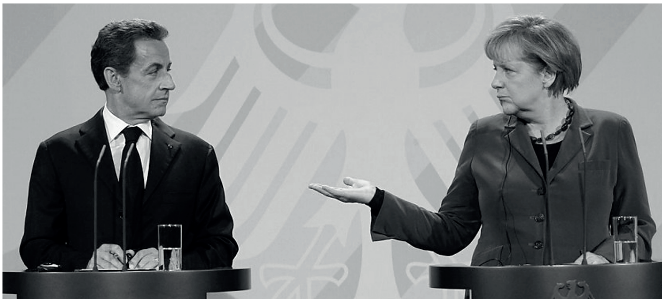
Merkozy at work: The Franco-German axis has played a central role in addressing the euro crisis.