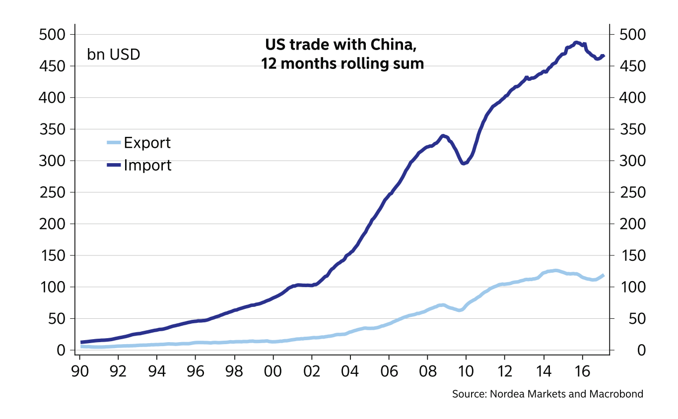
Chart 3. US-China trade is unbalanced