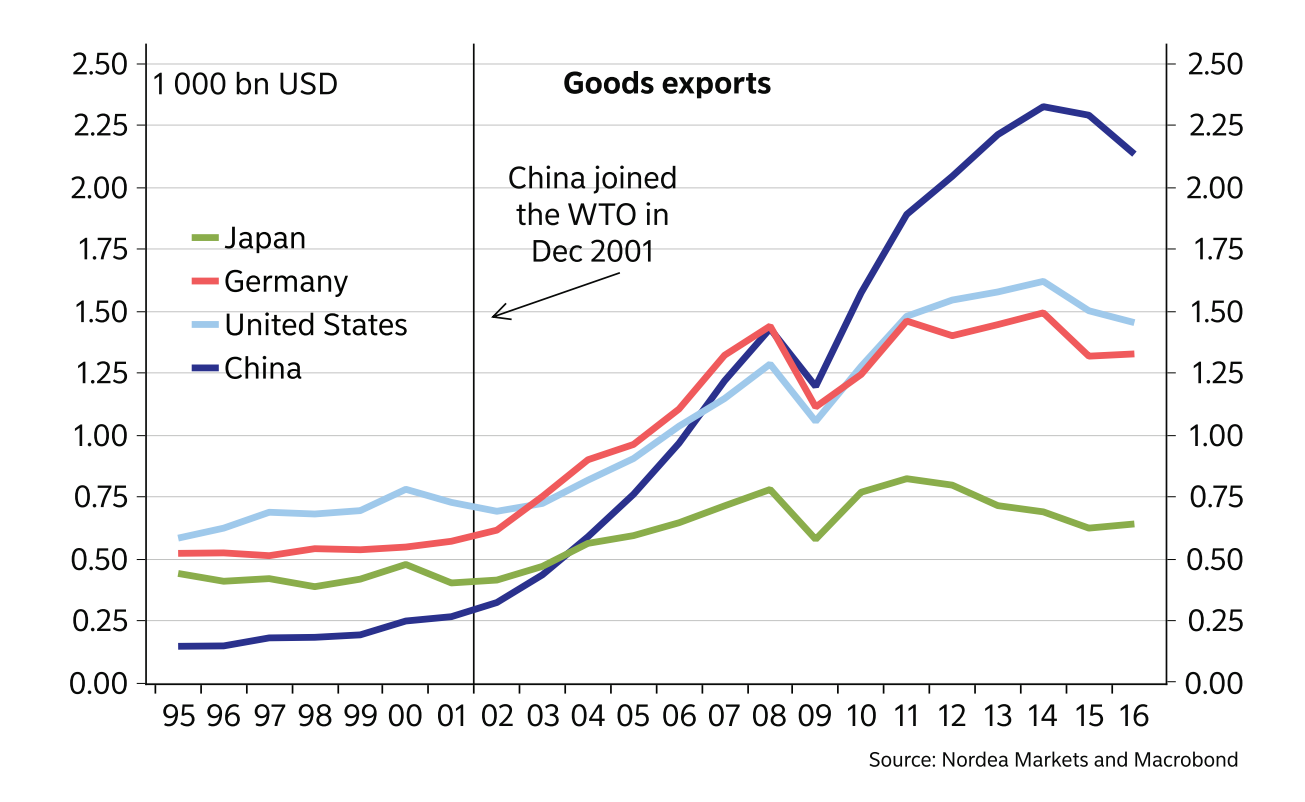
Chart 2. China's unprecedented rise to become the largest exporter

Along with the technological development, China's role is also evolving from being part of an international supply chain to an increasingly independent brand-maker and innovator. While in the pre-crisis period, more than 40% of China's imports were parts and components for the processing sector, the share is now less than a quarter.